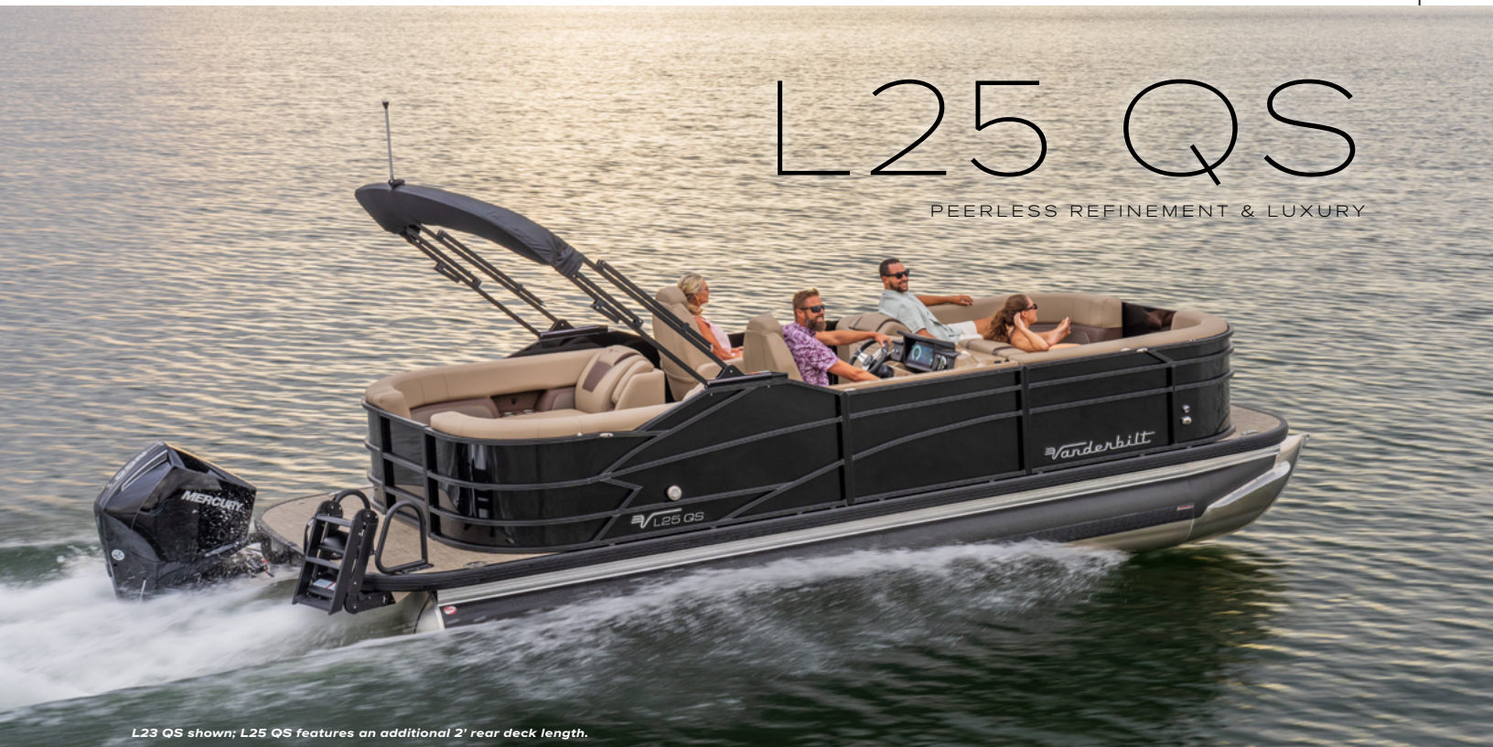
L23 QS shown; L25 QS features an additional 2' rear deck length.