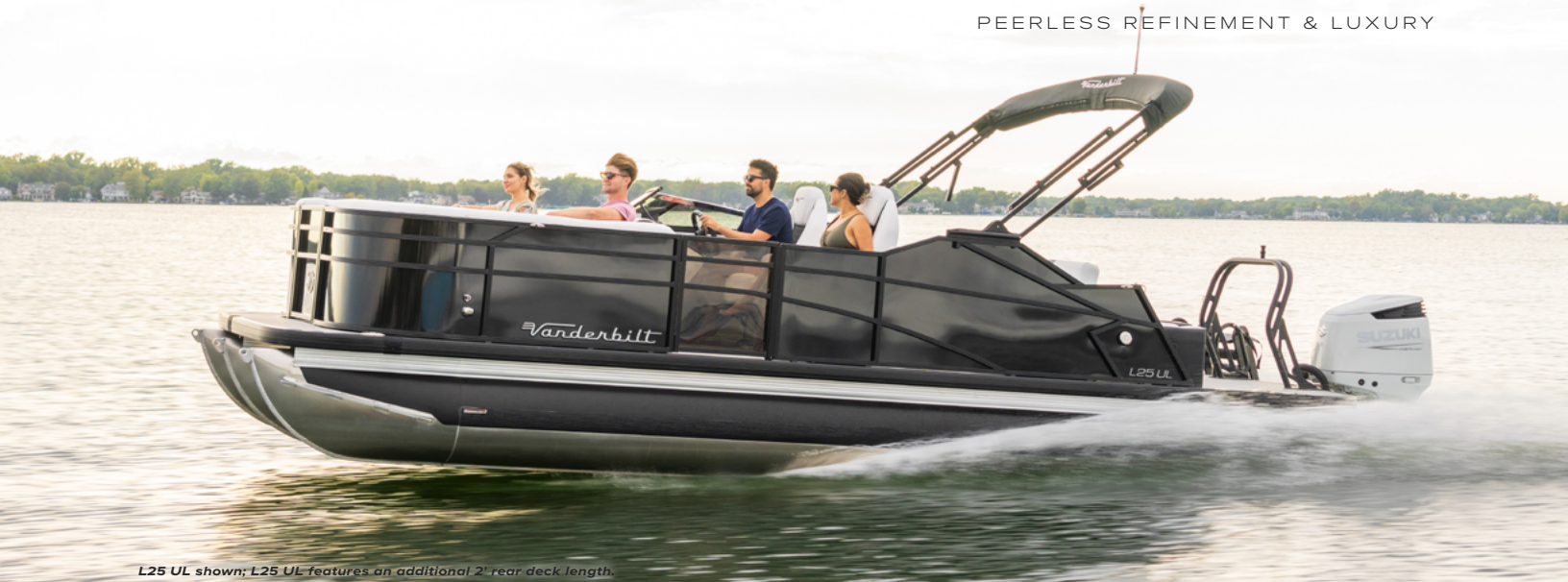
L25 UL shown; L25 UL features an additional 2' rear deck length.